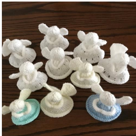
Two of our members have been knitting angels for the Methodist Homes Association in Shifnal.